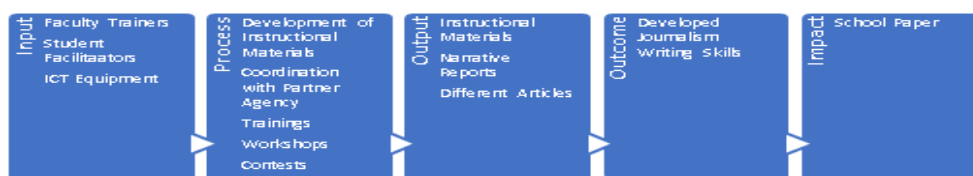
Figure 1. Project Methodology